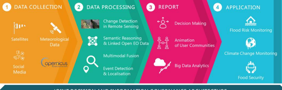
JOINT DECISION AND INFORMATION GOVERNANCE ARCHITECTURE

The overall objective of EOPEN is to provide a platform targeting non-expert EO data users (non-traditional user communities), experts and the SME community that reveals and makes Copernicus data and services easy to use for Big Data applications by providing EO data analytics services, decision making and infrastructure to support the Big Data processing life-cycle allowing the chaining of value adding activities across multiple platforms.